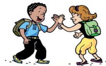
Blessing the Backpacks

In worship we will recognize and pray for all students and teachers who are beginning a new school year. Children and youth are invited to bring their school bags for the Blessing of the Backpacks.